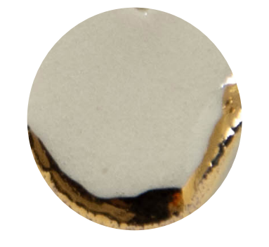
harmony collection colours

The delicate and chic style of this collection is timeless and classic. The 10 carat gold chains provide a daintiness that flows well with the porcelain pieces. Designed with bridesmaids in mind, these pieces are perfect for a subtle and stunning look.